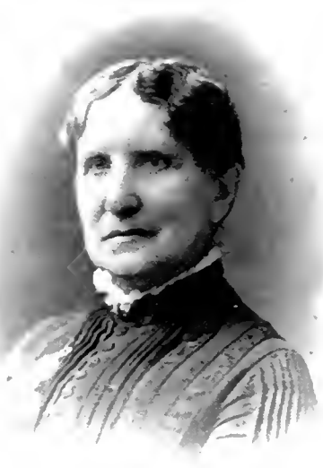
MARY ASHTON RICE LIVERMORE.

sent to the female seminary in Charlestown, Mass., now Boston, where she completed the four-year course in two, when she was elected a member of the faculty, as teacher of Latin and French. While teaching, she continued her studies in Latin, Greek and metaphysics under tutors, resigning her position at the close of the second year to take charge of a family school on a plantation in southern Virginia, where she remained nearly three years. As there were between four and five hundred slaves on the estate, Mrs. Livermore was brought face to face with the institution of slavery and witnessed deeds of barbarism as tragic as any described in "Uncle Tom's Cabin." She returned to the North a radical Abolitionist, and thenceforth entered the lists against slavery and every form of oppression. She taught a school of her own in Duxbury, Mass., for the next three years, the ages of her pupils ranging from fourteen to twenty years. It was in reality the high school of the town, and was so counted,